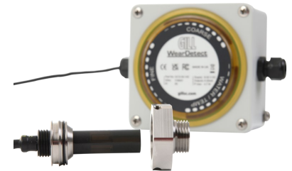
Sensor with display electronics

Supplied with a local display unit, the sensor can be installed into a wide variety of fittings and is available with either a 0-10V, 4-20mA or CAN digital output.