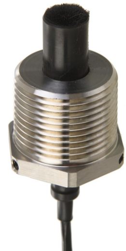
Sensor with debris attached