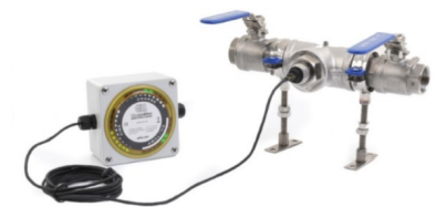
Optional In-flow adaptor